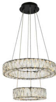
Black Item No:3503G18BK