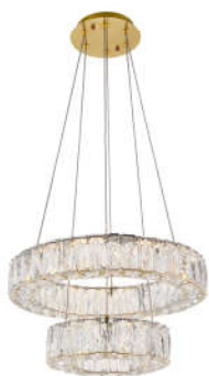
Gold Item No:3503G18G